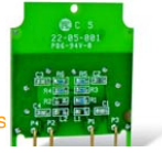
Table 52 SCS-1G Series Cable Simulators