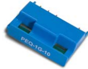
Table 27 PEQ-1G Cable Equalizers