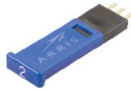
Table 12 JXP Series Forward/Return PAD Attenuators