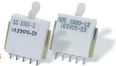
Table 61 S-Series Distribution Accessories