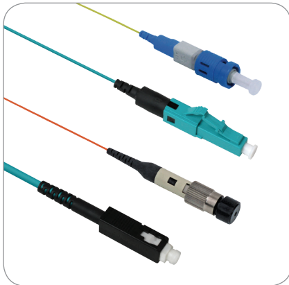
FUSEConnect Connectors (SC, FC, LC, ST)